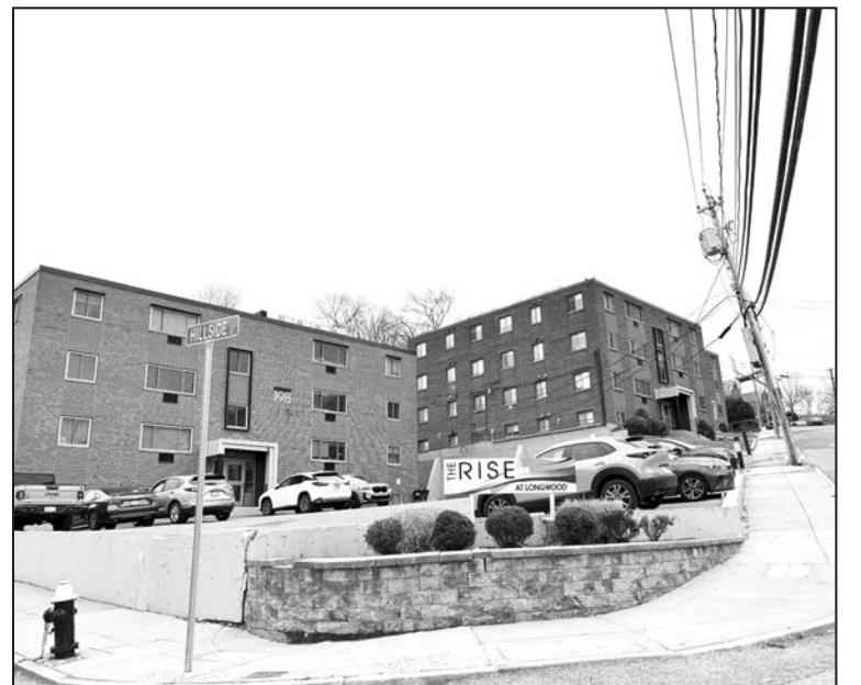
Parking lot currently located where 36 Parker Hill Avenue will commence building.