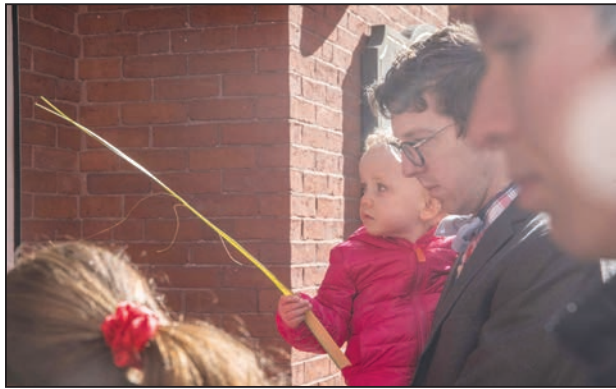
Parishioners follow into St. Cecilia Church to continue the Palm Sunday service.