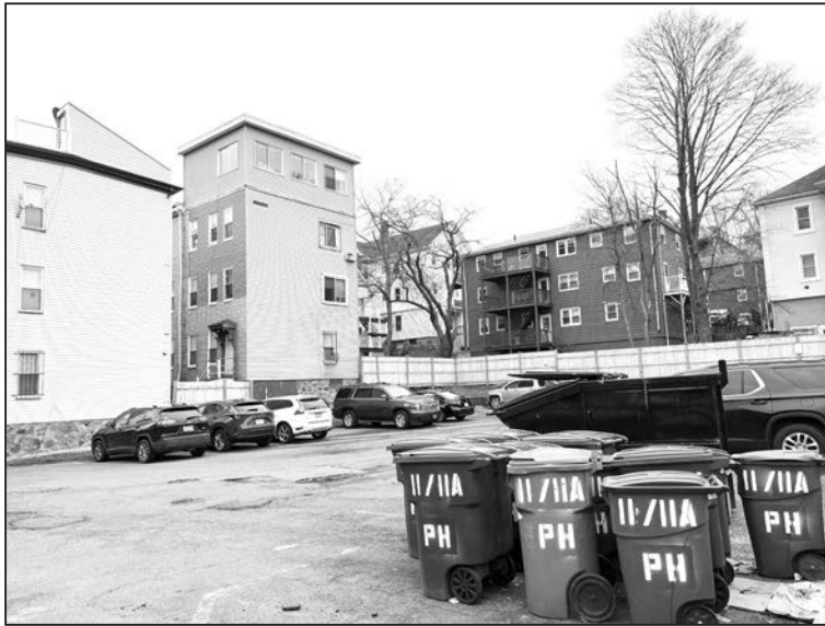
Parking lot located behind 11 Parker Hill Avenue, where the six story addition will be built.

Boston’s Planning and Development Agency must approve