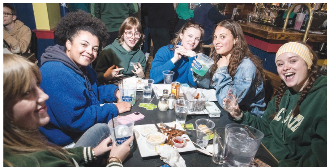
Friends convene to enjoy St. Patrick's Day together.

To Advertise in the Mission Hill Gazette Please call 781-485-9588