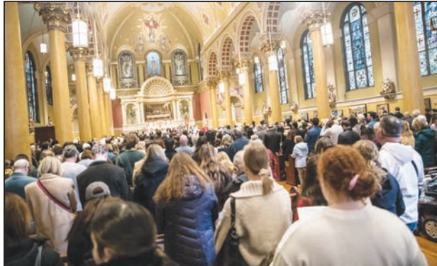
Parishioners inside St. Cecilia Church.