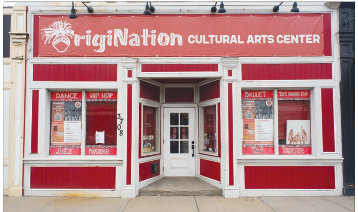
The front of OrigiNation Cultural Arts Center, on Washington Street.