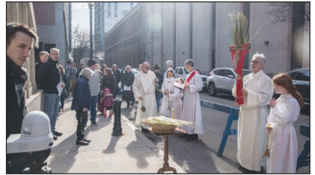
The sidewalk on Belvedere Street is readied for the Palm Sunday procession outside of St. Cecilia Church.