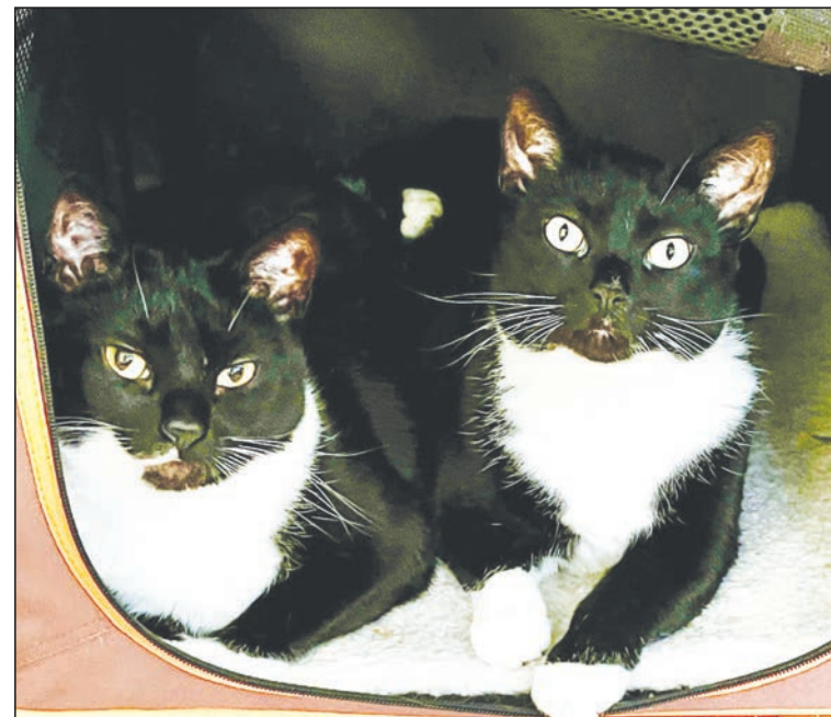
These kitties had time to adjust to their crate before moving day.