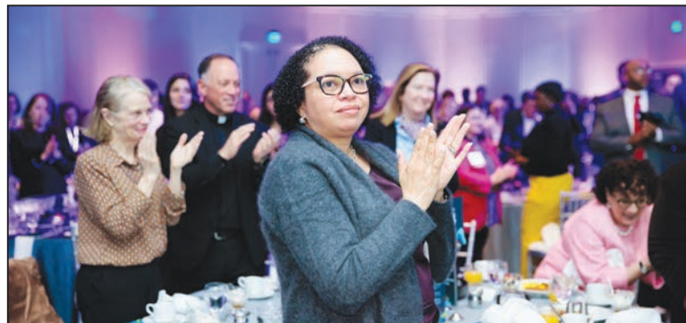
The crowd applauds at Pine Street Inn's Home Remedy breakfast.