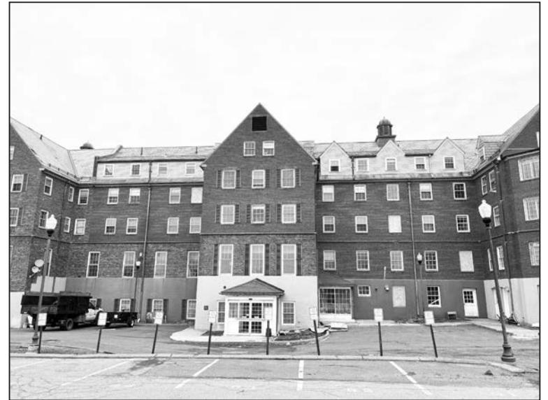
Westside entrance of the current building under review and located at 85 Parker Hill Avenue.

“We need more talking to each other,” he said. “I’m sure there are quite a few people here who could take us around or give us the other perspective... and to